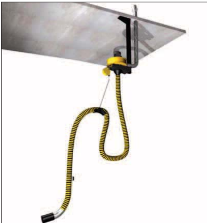
FEF with PA-110 extension mount.