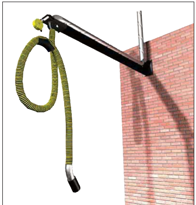
FE with PA-220 extension mount.

PlymoVent reserves the right to make design and technical changes.